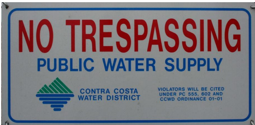
Coursemarker "NO 555" ? Or not a government sign? There were several "NO" spaces on the Report Form.